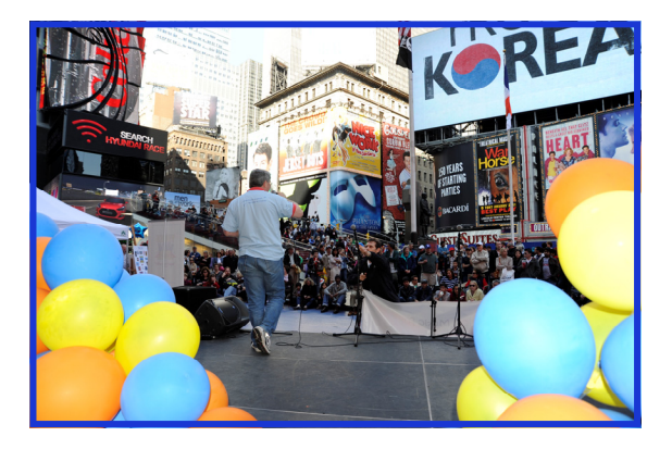
Magical Music for Life<sub>™</sub> Foundation is thrilled to present its 6th annual TUNES IN TIMES SQUARE benefit concert Sunday, May 7, 2017 on Broadway between 46<sup>th</sup> & 47<sup>th</sup> Streets in Times Square at 10:00 a.m. - 6:00 p.m.