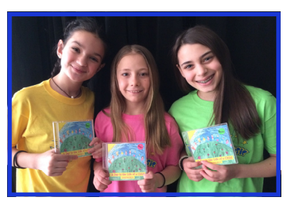
Magical Music Troupe members with our A Day in the Life of a Child album

Magical Music for Life n, founded in 1999, is a nonprofit charitable organization whose mission is to use music to better the lives of children. Toward this end, MMFL has produced a wide range of musical projects with positive messages for children. These projects include: