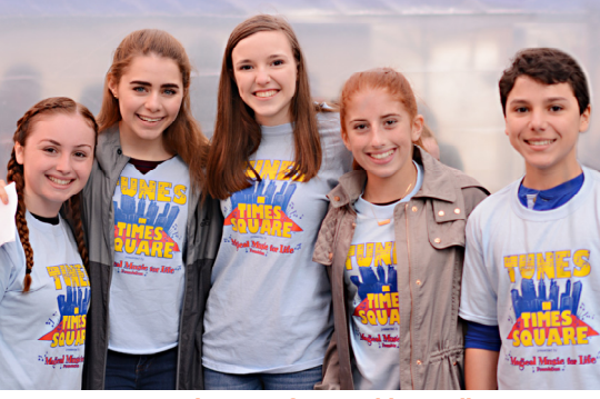
Mary Poppins cast after teaching audience "Supercalifragilisticexpialidocious"

"My daughter and I were walking by, thought we would stay for a song or two, and stayed for 3 hours."